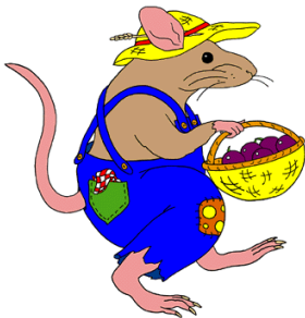
from "The Country Mouse and The City Mouse"

Sam worked hard in his garden. He liked the vegetables and flowers that grew there. In fact, he liked everything about the country.