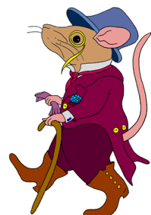
from "The Country Mouse and The City Mouse"